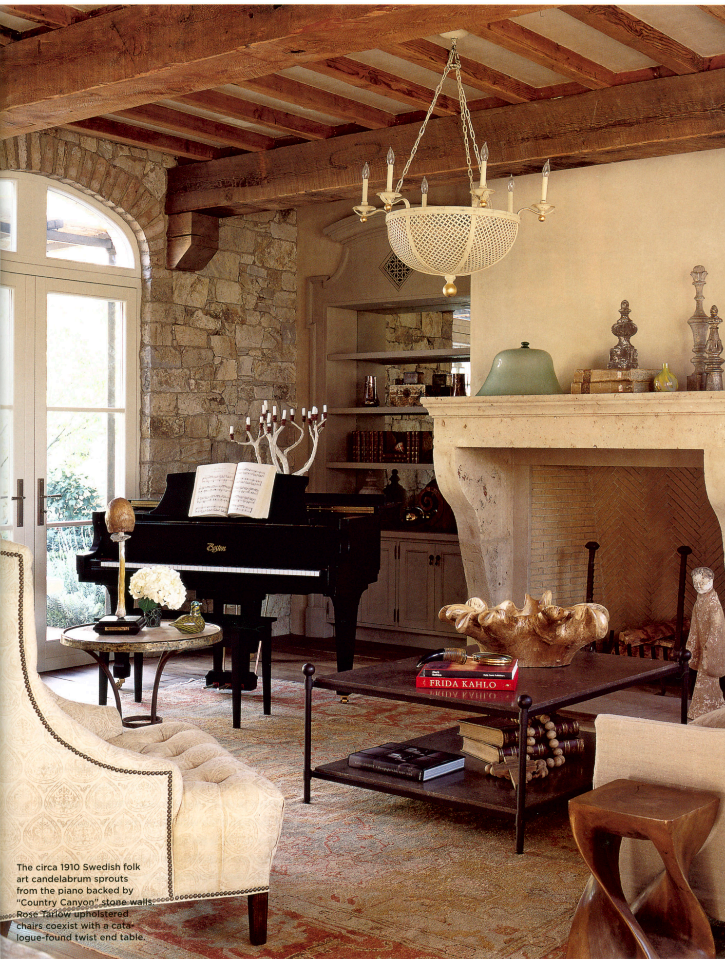
The circa 1910 Swedish folk art candelabrum sprouts from the piano backed by "Country Canyon" stone walls. Rose Tarlow upholstered chairs coexist with a catalogue-found twist end table.