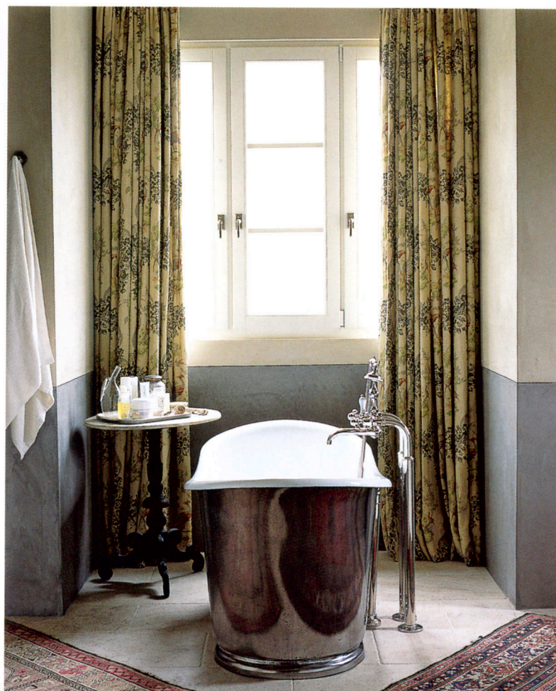
Parchment and dove grey Venetian plaster walls in the master bath embrace a sleek Waterworks tub. OPPOSITE The master bedroom's custom bed complements the 19th century Gustavian settee.